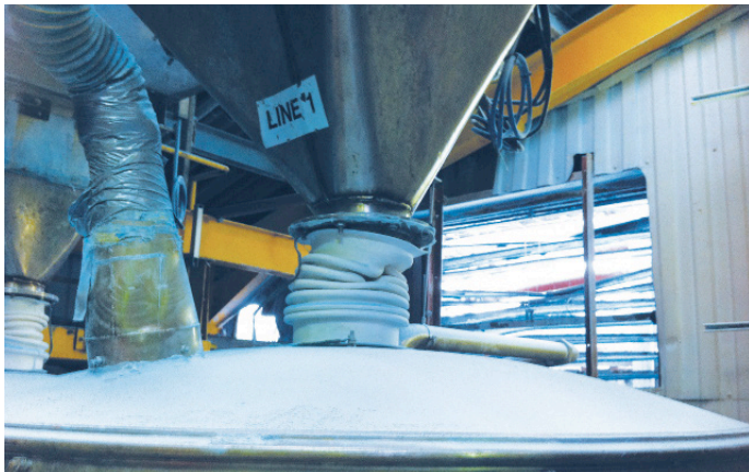
VIBRATORY FEEDER INLET - BEFORE

A leading UK plaster manufacturer was having an issue with the flexible connectors on a vibrating sieve lasting only a week at a time before tearing, causing major dust leakage and requiring significant maintenance downtime. Plaster is very fine and is difficult to contain, but since installing BFM® fittings, there are no dust leaks and the connectors have already lasted more than 50 times longer than the previous jubilee-clip fastened connectors.